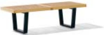
Nelson Platform Bench