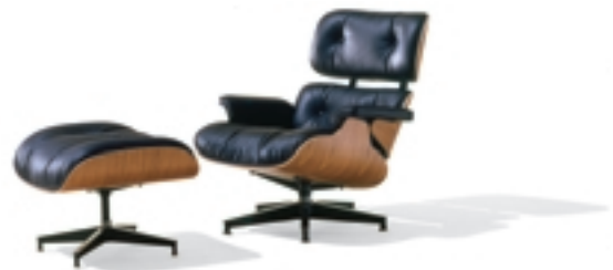
Eames Lounge Chair and Ottoman

Rubber-based, adjustable, stainless steel glides.