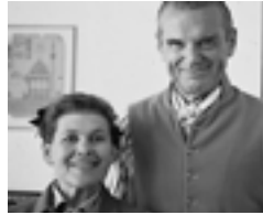
Charles and Ray Eames