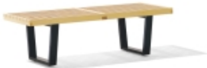
Nelson Platform Bench